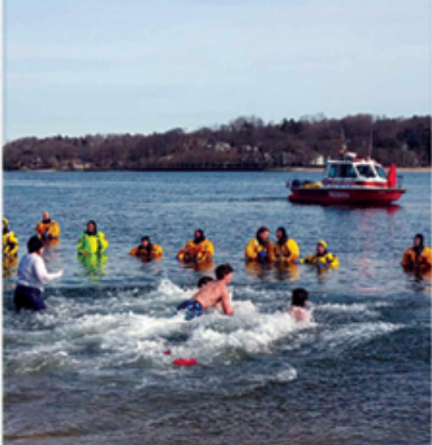
Freezing for a Reason - Annual Polar Plunge

Polar Plunge 1/18/25. It was really cold. Yet, a record number attended. They pledged, plunged, volunteered or watched groups of "plungers". This helped to warm the hearts of many. They raise funds for the Special Olympics of New York. The event was sponsored by the Town of North Hempstead & held at T. of N.H. Beach, PW. A great deal of funds were raised for this worthy annual event.